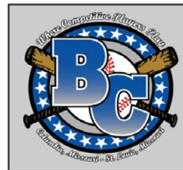
BC Baseball Shirt - 2 Shirt Special

Buy Tournament Shirt - Get BC Shirt For $7 !!!