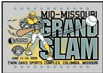
Tournament Shirt Design; Team Names On Back